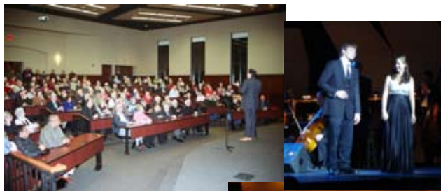
* L-R: Pre-concert Director lecture, D'Ambrosio Master Class contest winners, Member & Board appreciation reception, VWHS One Act Plays

“To provide a premier venue for a wide variety of performing arts, concerts, lectures, meetings, and special events which will inspire, educate and entertain residents of, and visitors to Van Wert County, and to provide an economic catalyst by increasing cultural tourism, creating new jobs, and generating business for the region.