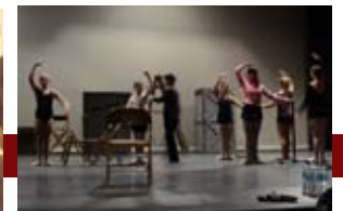
L-R: Amy Grant, VWHS Concert Choir, NY Ballet School Master Dance Class