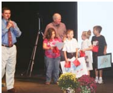
Steven Kellogg Lecture/Art Contest winners

Become a member today! Every gift matters.